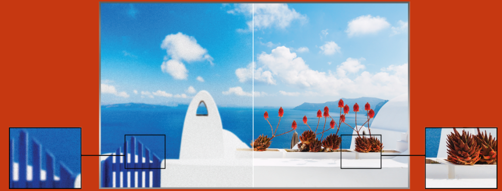
Without Noise Reduction Technology

*Apps shown is for reference purpose only.